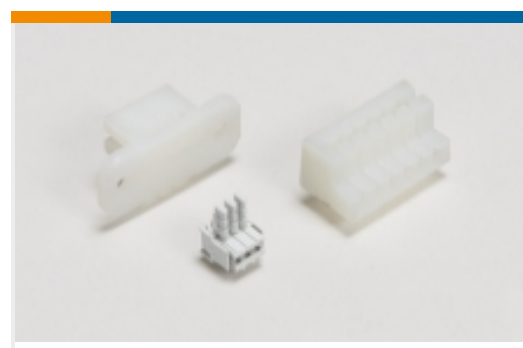
Card Edge Connector Housings(2)