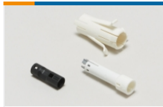
Plug & Socket Lighting Connector Accessories(1)