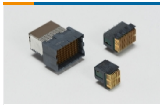
High Speed Backplane Connectors(11)